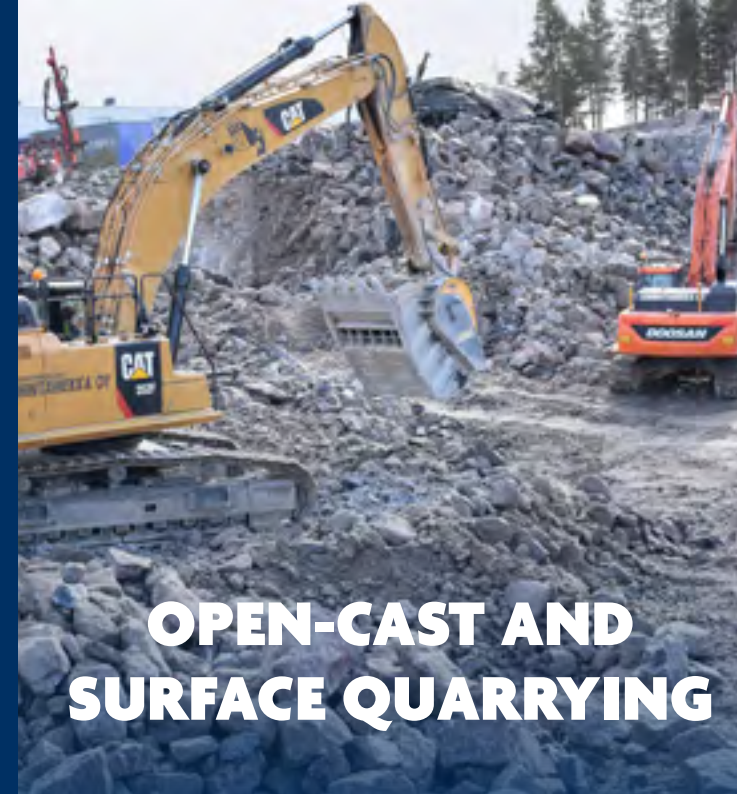
OPEN-CAST AND SURFACE QUARRYING

Together with our wide partner network we provide mining services from open-cast quarrying to wedging inside buildings and special methods. Thanks to our motivated personnel and modern equipment we are able to meet the demands of our customers.