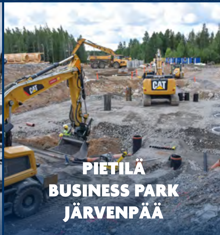
PIETILÄ BUSINESS PARK JÄRVENPÄÄ