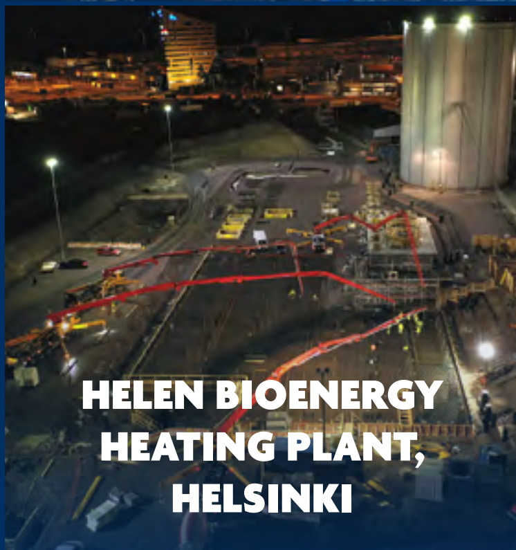
HELEN BIOENERGY HEATING PLANT, HELSINKI