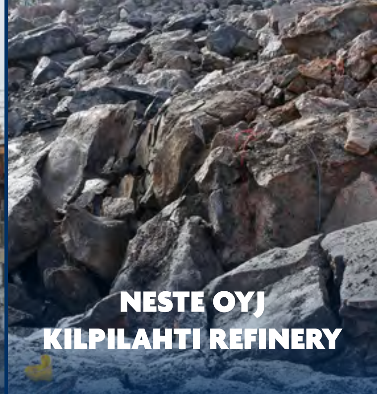
NESTE OYJ KILPILAHTI REFINERY