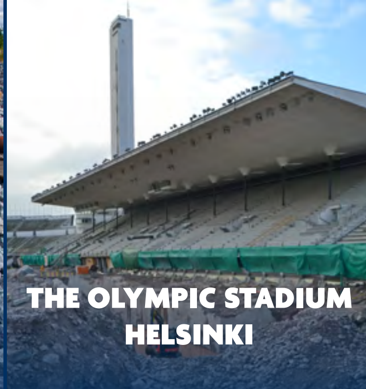
THE OLYMPIC STADIUM HELSINKI