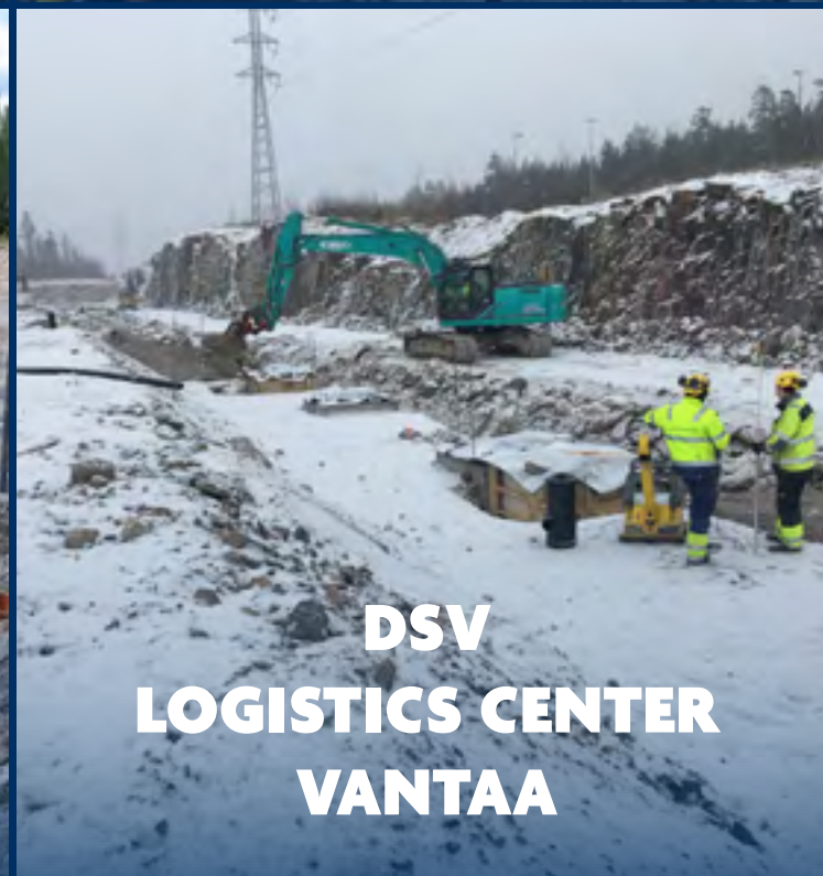
DSV LOGISTICS CENTER VANTAA