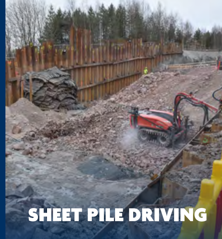
SHEET PILE DRIVING

For land construction, base and rock reinforcement we use the suitable methods. With our modern equipment and network of partners we are able to provide the most cost efficient and safest result in our customers project.