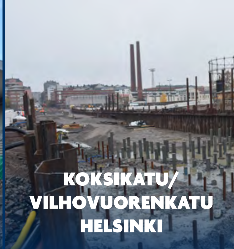
KOKSIKATU/ VILHOVUORENKATU HELSINKI