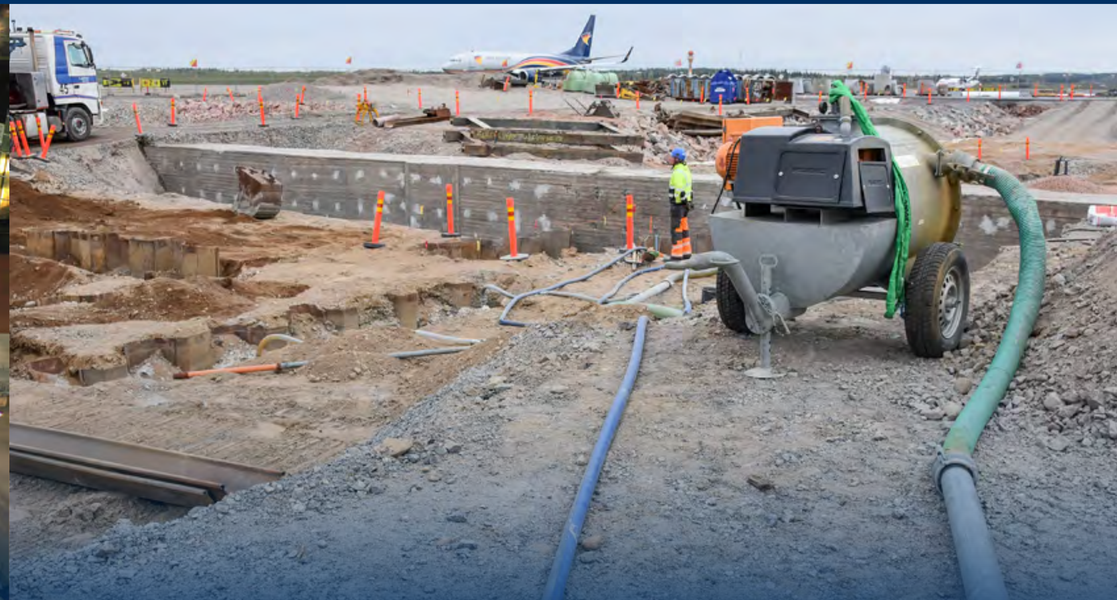
GROUND WATER PROTECTION AND LOWERING GROUND WATER LEVEL