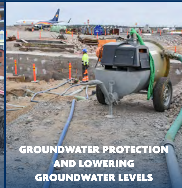
GROUNDWATER PROTECTION AND LOWERING GROUNDWATER LEVELS