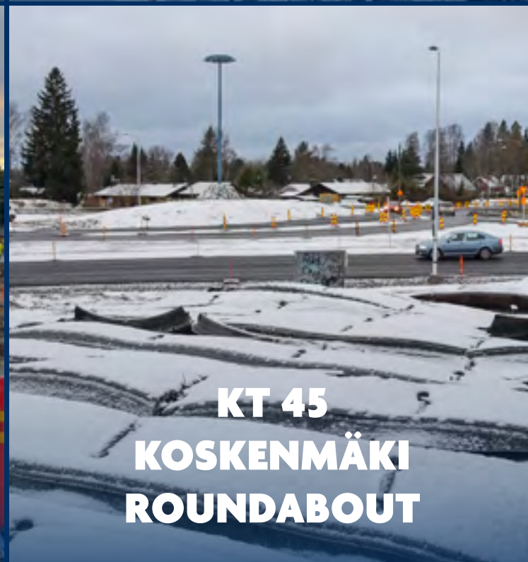
KT 45 KOSKENMÄKI ROUNDAABOUT