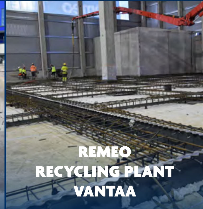
REMEO RECYCLING PLANT VANTAA