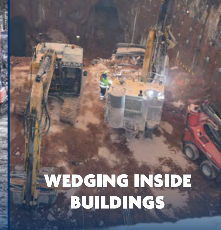
WEDGING INSIDE BUILDINGS