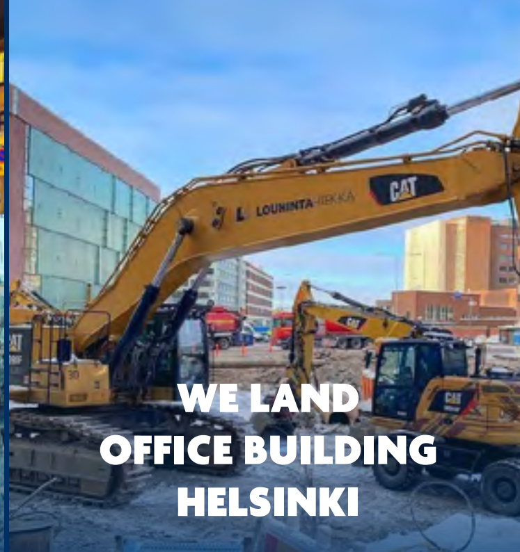
WE LAND OFFICE BUILDING HELSINKI