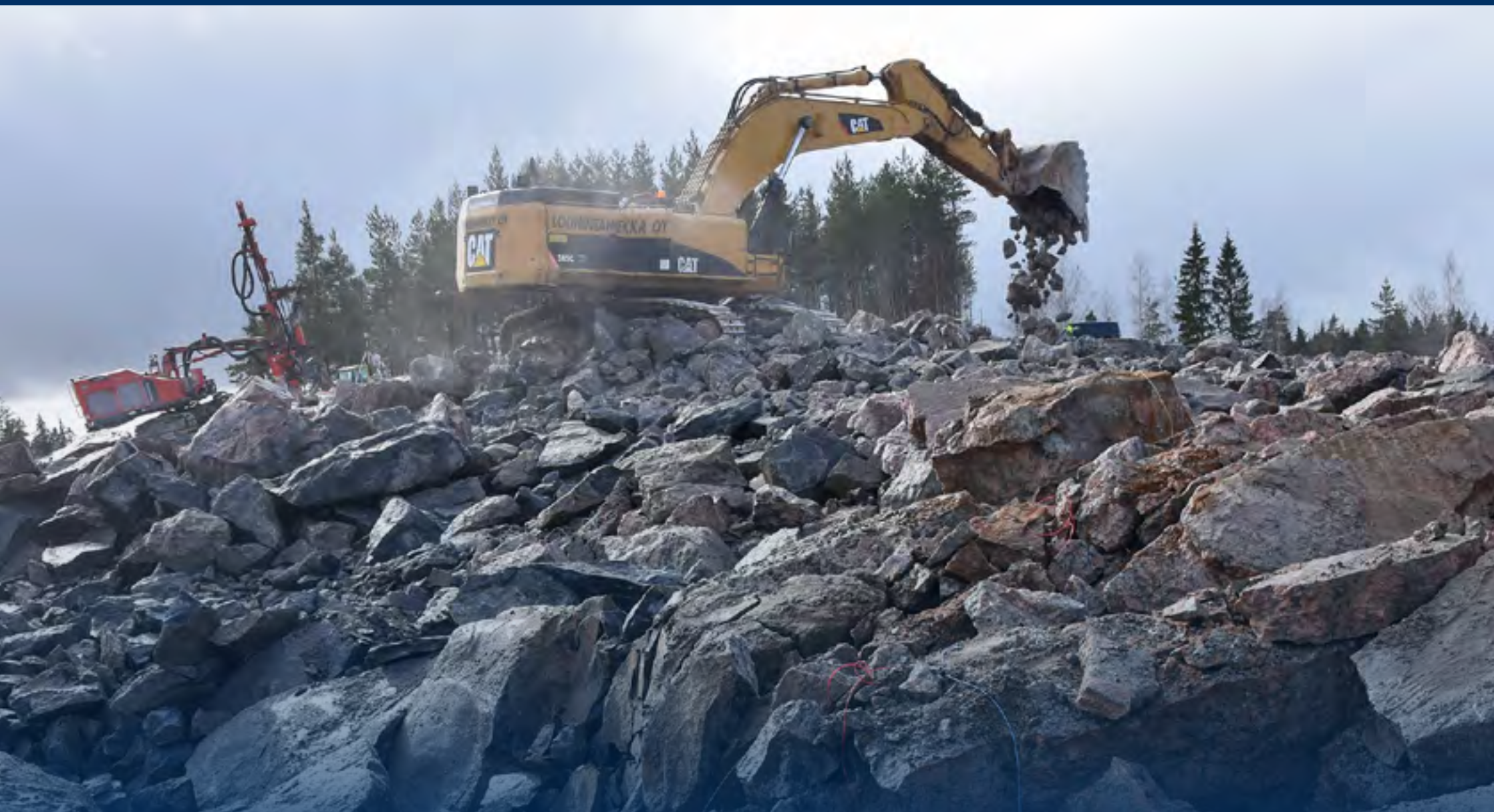
DRILLING AND BLASTING ETC.