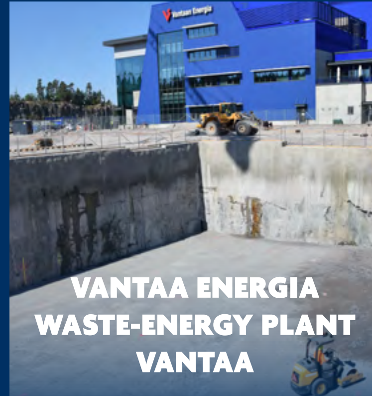
VANTAA ENERGIA WASTE-ENERGY PLANT VANTAA