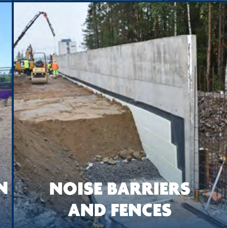
NOISE BARRIERS AND FENCES