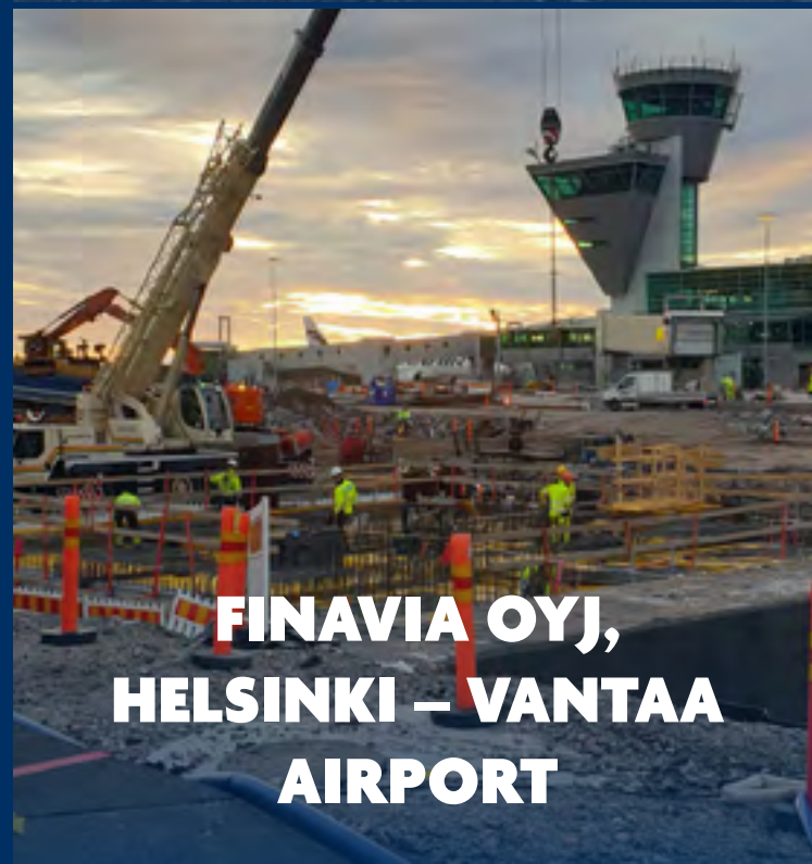
FINAVIA OYJ, HELSINKI – VANTAA AIRPORT