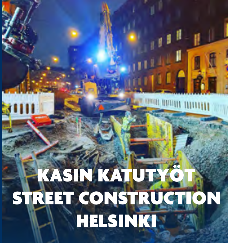
KASIN KATUTYÖT STREET CONSTRUCTION HELSINKI