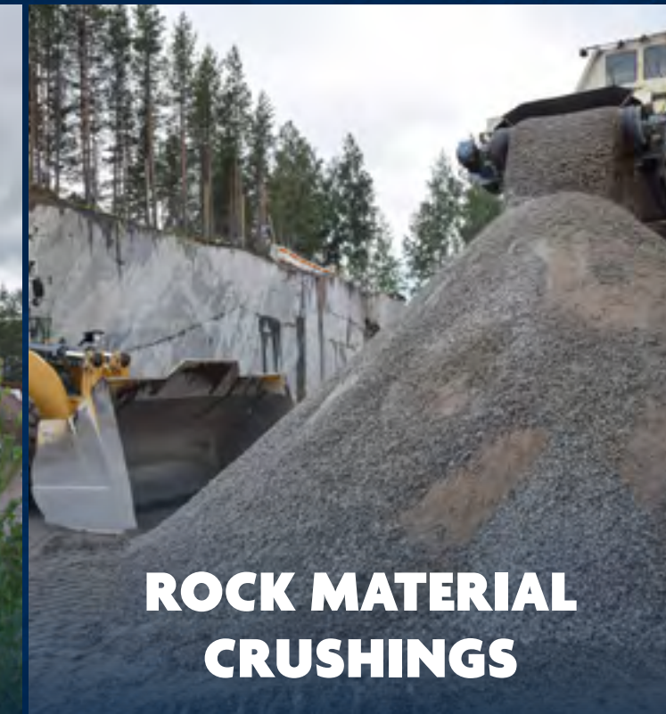
ROCK MATERIAL CRUSHINGS