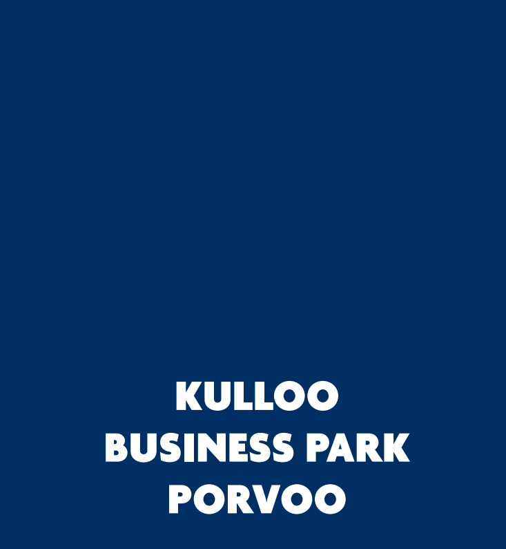
KULLOO BUSINESS PARK PORVOO