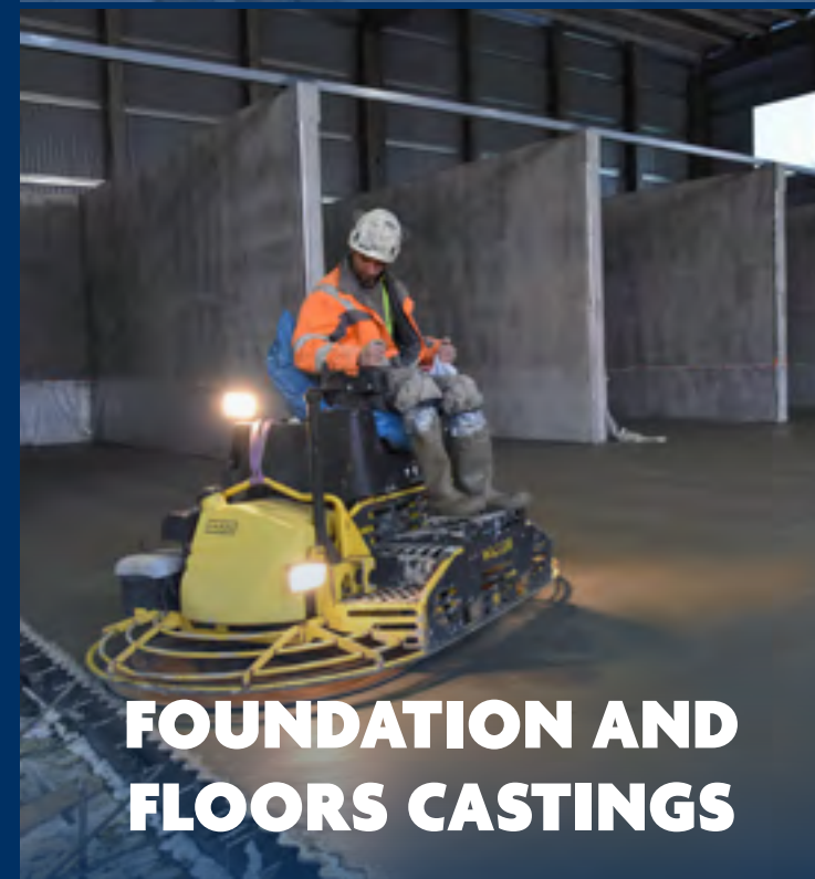
FOUNDATION AND FLOORS CASTINGS