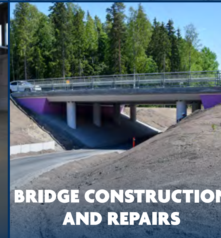
BRIDGE CONSTRUCTION AND REPAIRS