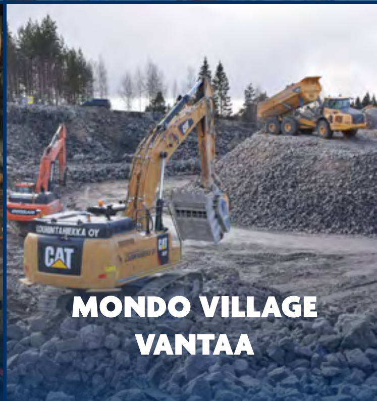
MONDO VILLAGE VANTAA